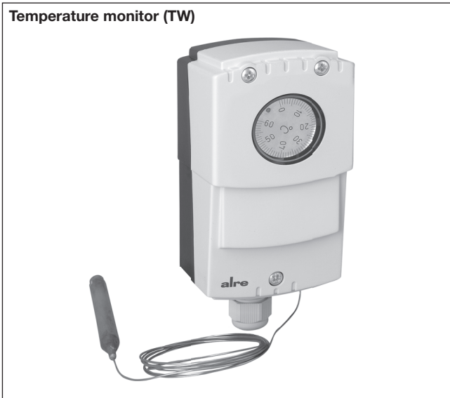
Temperature monitor (TW)