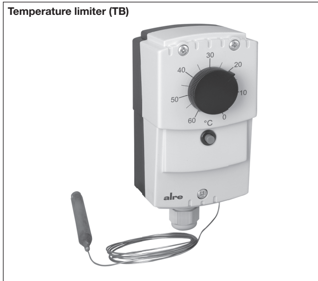
Temperature limiter (TB)